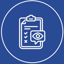
Pre-op & Post-op Cataract Care