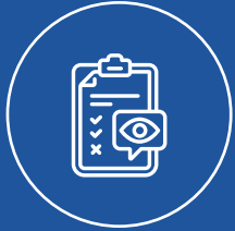
Pre-op & Post-op Cataract Care