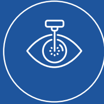
YAG Laser Treatment